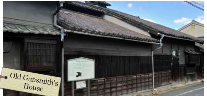
Old Gunsmith's House

This is one of the most famous shrines in Sakai with a history of over 1,000 years. • Tea will be served during the opening period (fee applies). • November 3 (Fri.): A free concert will be held. Nearest station: Shukuin Station on the Hankai Electric Railway